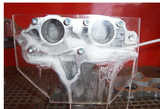
2. Cast body opened, with Makrolon sheet. Cleaning inside the body with flexible nozzle