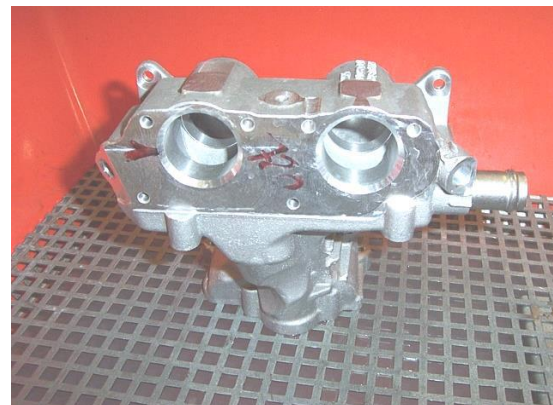
1. Cast body closed, before cleaning: Contamination in cavities not visible from the outside

In this particular application, tests were carried out at the customer's site, using cast bodies covered with a Makrolon sheet. Cleaning was demonstrated using a flexible nozzle SR-FX in the cavities of the cast body.