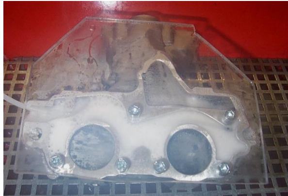
3. High flushing and cleaning performance down to the chambers systems